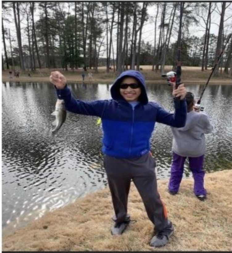
One of the campers! The first fish he has ever caught!