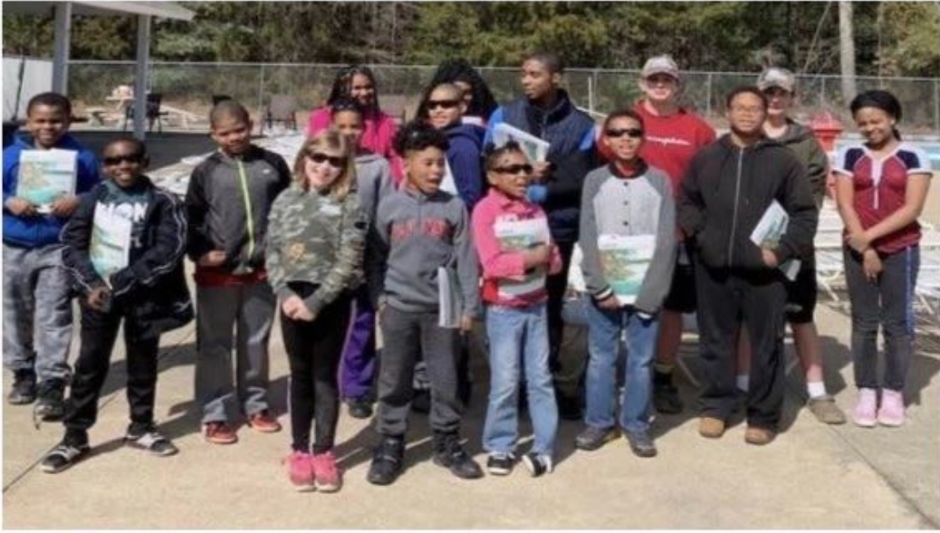
The “Hooked on Fishing” Camp