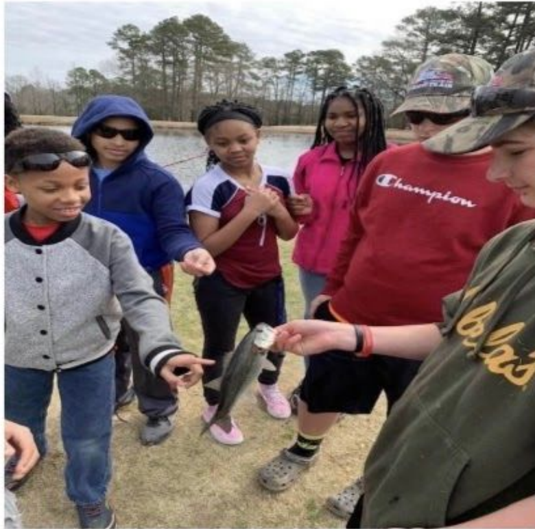
My friend (volunteer) & myself showing the campers what type of fish they caught and how to unhook the fish and release the fish back to the water.