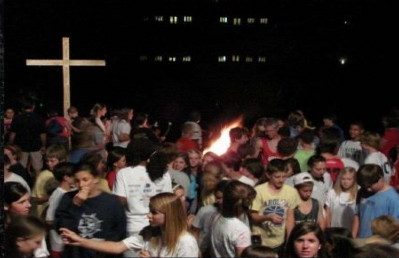
FCA Middle School Retreat Bonfire at Camp Oak Hill